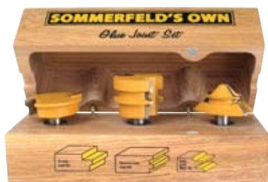
Box has flush-mounted magnetic catch.