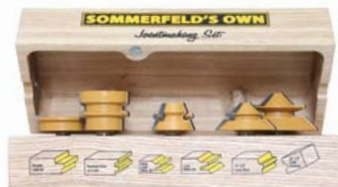
Box has flush-mounted magnetic catch.