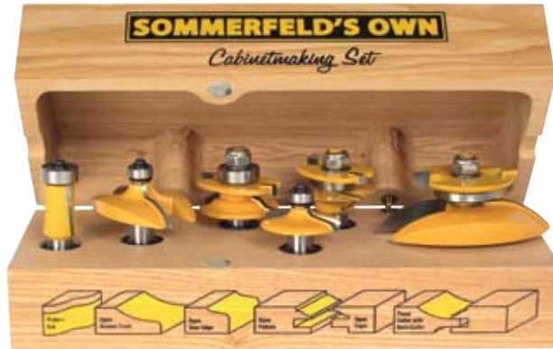
Box has flush-mounted magnetic catch.

You don't need big, expensive equipment to make beautiful arched raised panel doors and panels. – you need the NEW Sommerfeld's Cabinetmaking Set. This newly-designed set includes 6 professional-quality router bits to make your job of building raised panels the easiest yet.