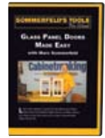
This set is great for making divided light doors such as the one above!