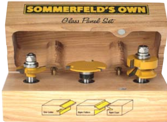
Box has flush-mounted magnetic catch.