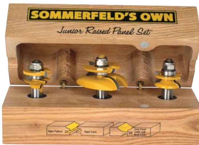
Box has flush-mounted magnetic catch.