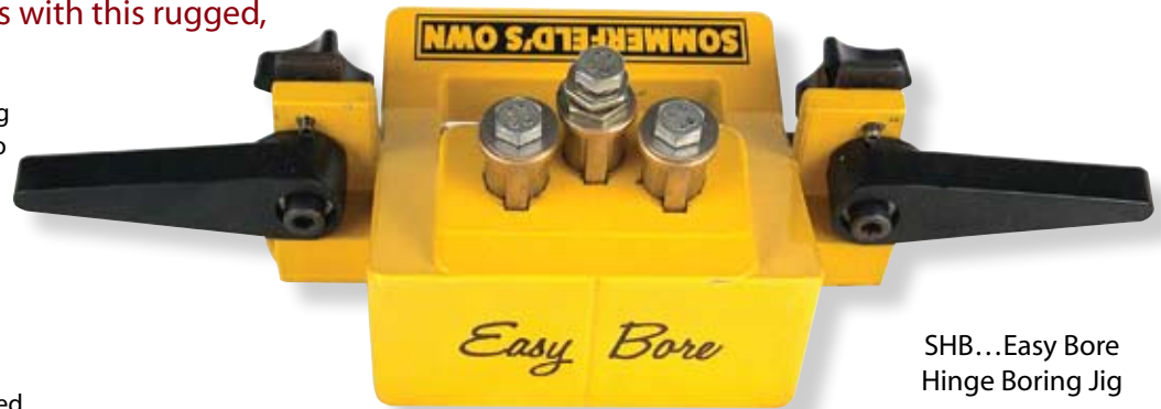
SHB... Easy Bore Hinge Boring Jig

O ur hand-clamped boring jig drills a 35mm hole and two aligning 8mm holes at the same setting, which allows you to accurately install your hinges with ease and speed. No screwdriver is needed to install, just a hammer to lightly tap the hinges in place. Hinges have special plastic inserts around screws which stay imbedded in wood; hinge can then be unscrewed if needed while finishing etc. The jig has adjustable stops which allow for different overlays. We use setting number 2 for 1/2"