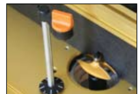
Lift Crank hole for Triton 2-1/4" Routers already bored in Tabletop