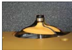
Make Zero Clearance Fence Inserts to match your bits. 3 blanks included.

...prove everything we've said...in your own shop