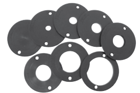
Solid, 1/2", 3/4", 1", 1-1/4", 1-1/2", 2" & 2-5/8" twist-lock Insert Rings & Spanner Wrench included

Our full-featured Triton 3-1/4 hp Routers are ideal for use with this Table - SEE PAGE 10