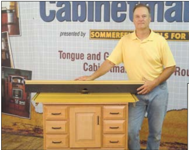
Large workpieces or small, this 45# Table and its 48" long Fence will handle them with ease and precision

Marc Sommerfeld's Router Tables Made Easy DVD. In this DVD, Marc leads you step-by-step through building this great cabinet for your new Router Table System. Plus...pick up loads of great tips and secrets from one of America's leading cabinetmaking experts.